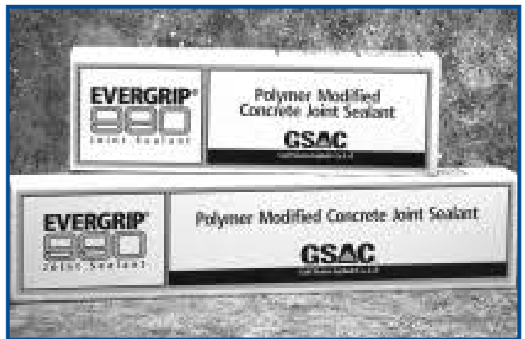
Martin Asphalt-STRIPS POLYMER MODIFIED CONCRETE JOINT SEALANT